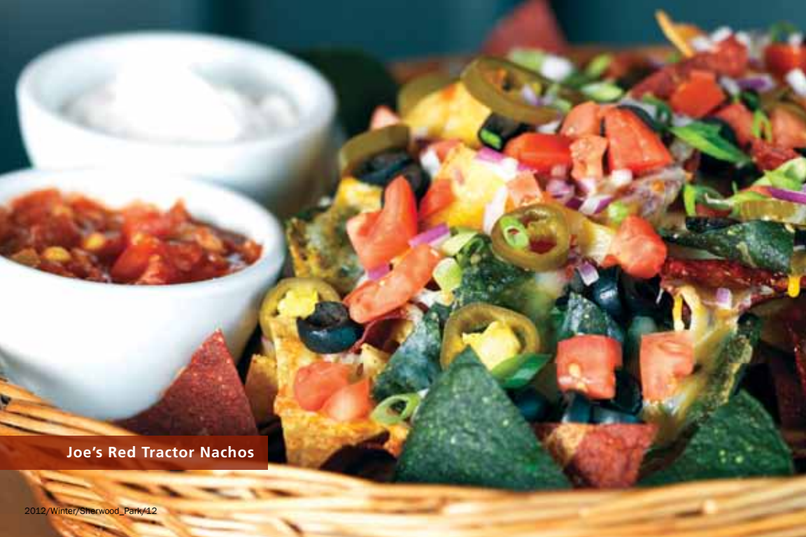
Joe's Red Tractor Nachos