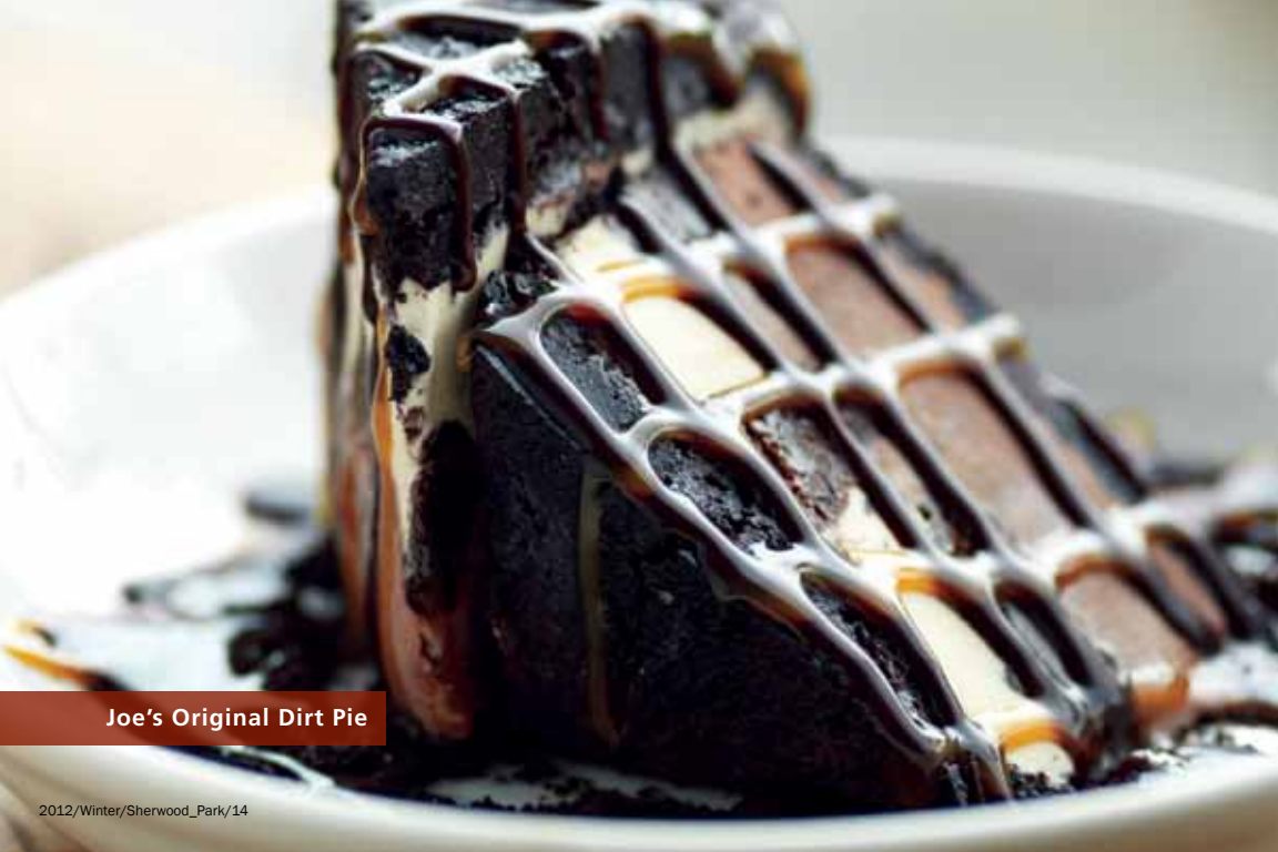
Joe's Original Dirt Pie