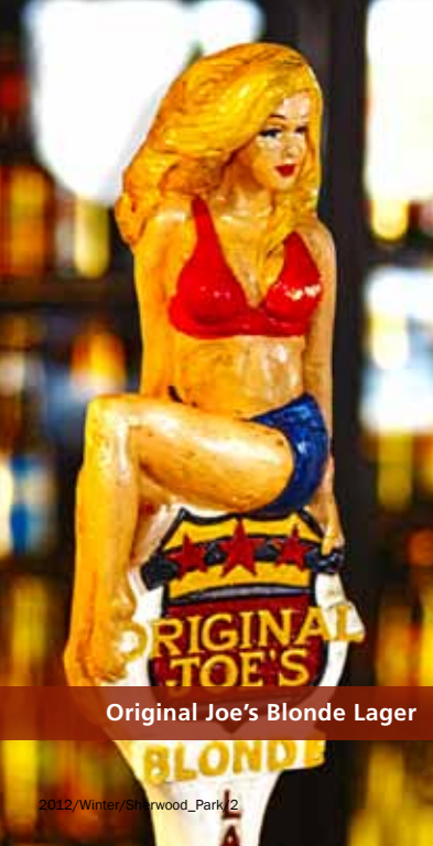
Original Joe's Blonde Lager